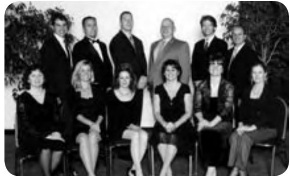
Class of 1995