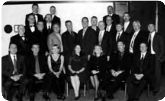
Class of 1985