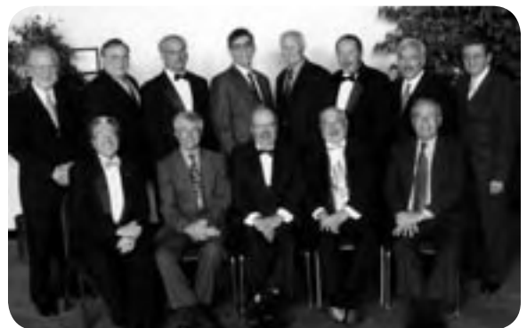
Class of 1970