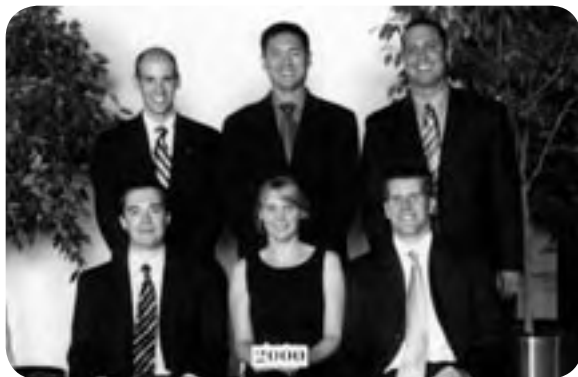
Class of 2000