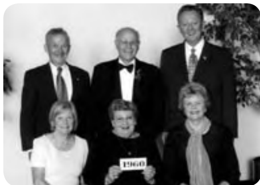
Class of 1960