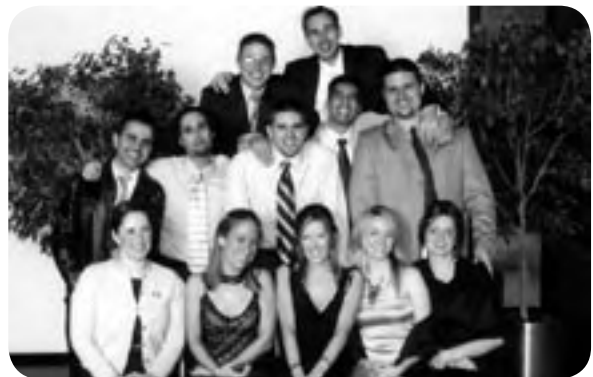
Class of 2006