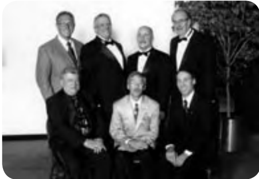
Class of 1975