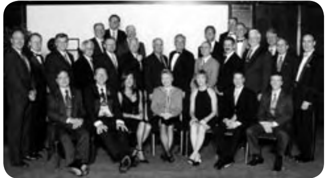
Class of 1980