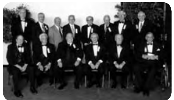
Class of 1955