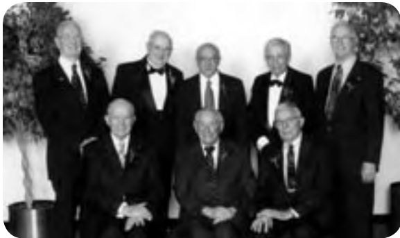
Class of 1945