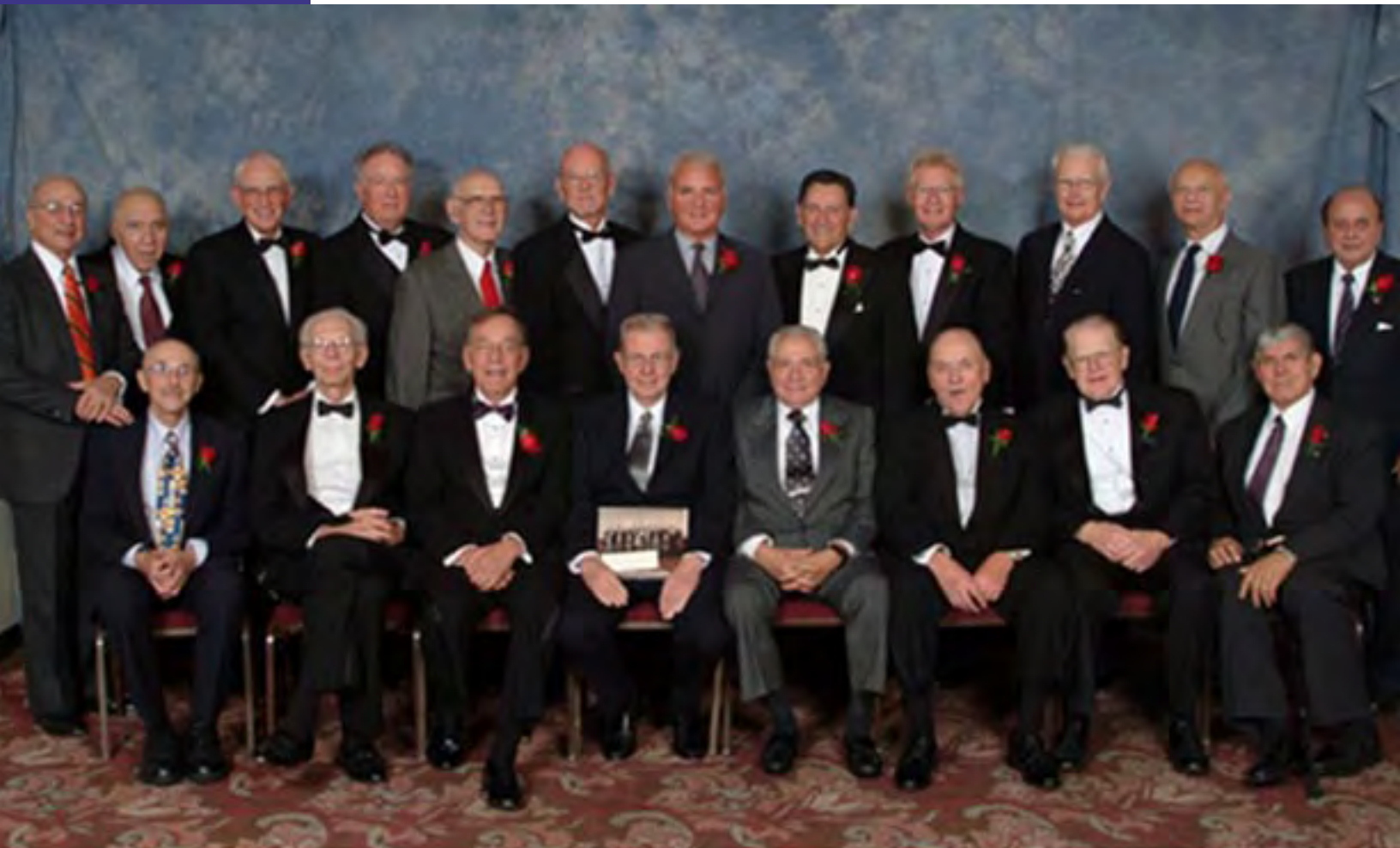
Class of 1956 -- 50-Year Class Photo (See additional reunion class photos on pages 8-9.)