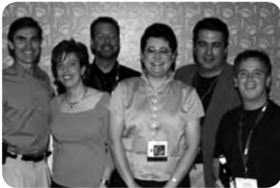
Class of 1990