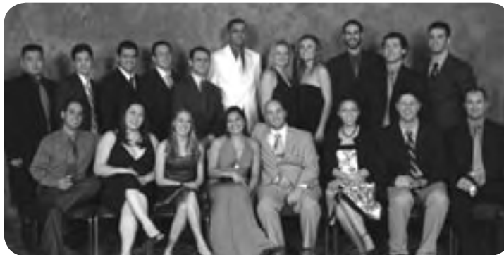
Class of 2007