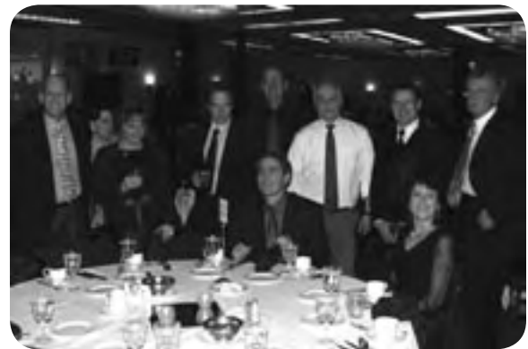
Class of 1976